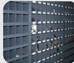
(Before and After Photos)