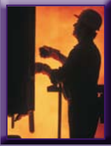
Direct contact with electrical systems