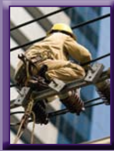
Potential contact with overhead wires