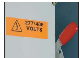
Safety & Facility ID