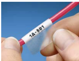
Self-Laminating Wire Markers