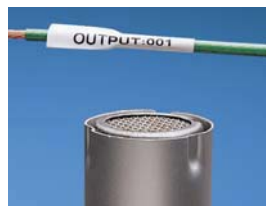
Heat Shrink Wire Markers